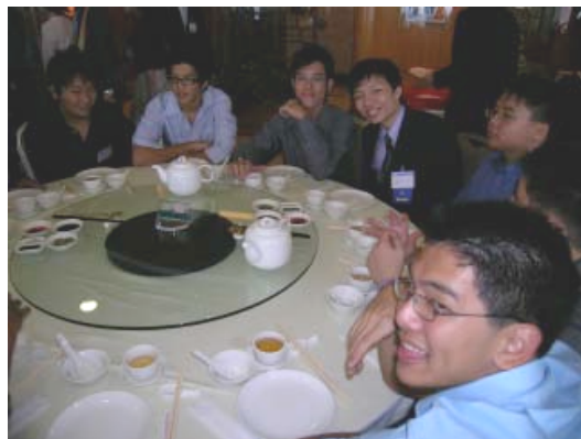
Lunch @ Hong Kong Poly University