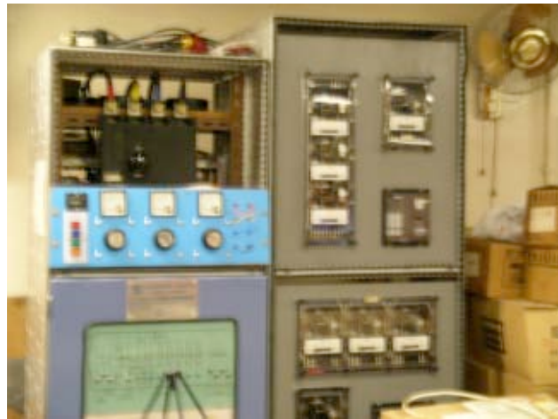
Electrical Services Lab