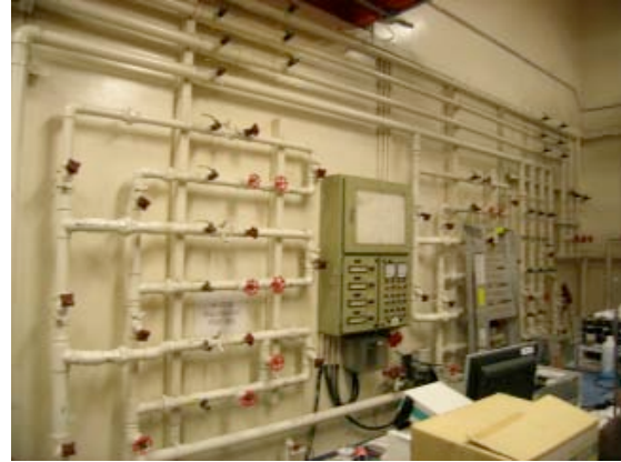
Fire Engineering Lab....