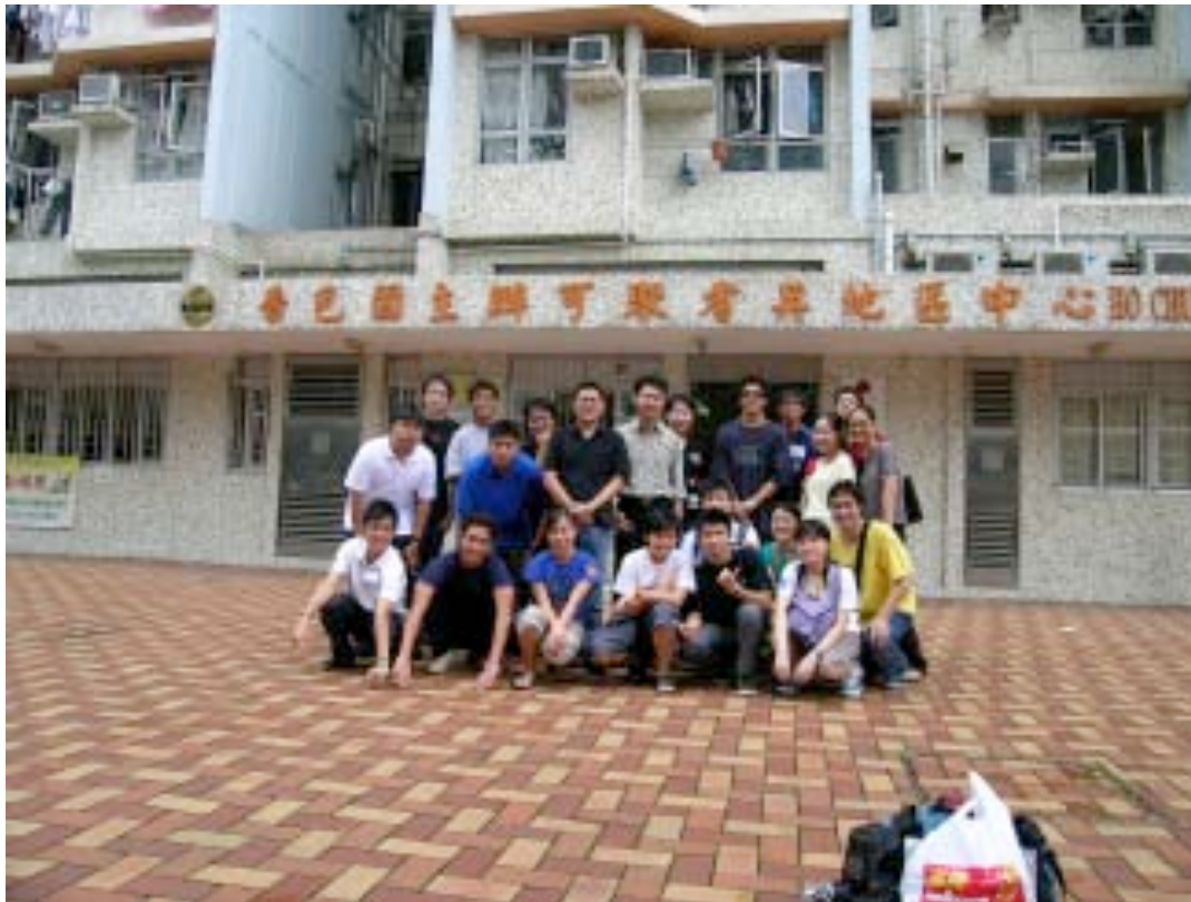
Group photo @ the outside of the elderly centre

The night before coming back to Spore, students took the opportunity to visit the shopping centres and the tourist attractions nearby the hotel.